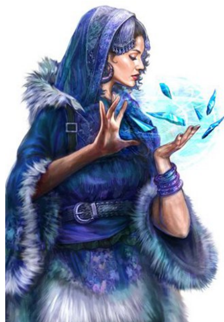
"Angry enough to bring down a mountain" is not hyperbole to lamias.

Tremors. Each character takes 1d4 combat damage. Advance the blessings deck again, then shuffle the Sihedron Medallion back into the blessings deck.