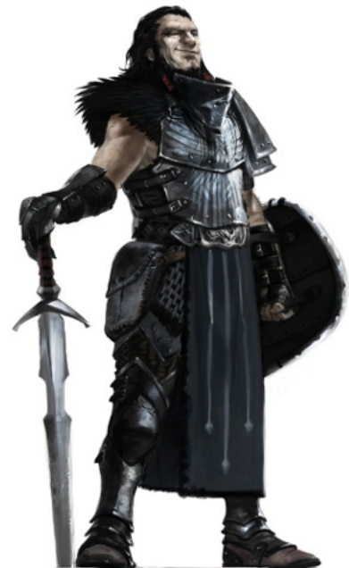
His strongest armor is his smugness.

Popular Uprising. Each character takes combat damage equal to the number of allies in her hand and discard pile. Advance the blessings deck again, then shuffle the Sihedron Medallion back into the blessings deck.