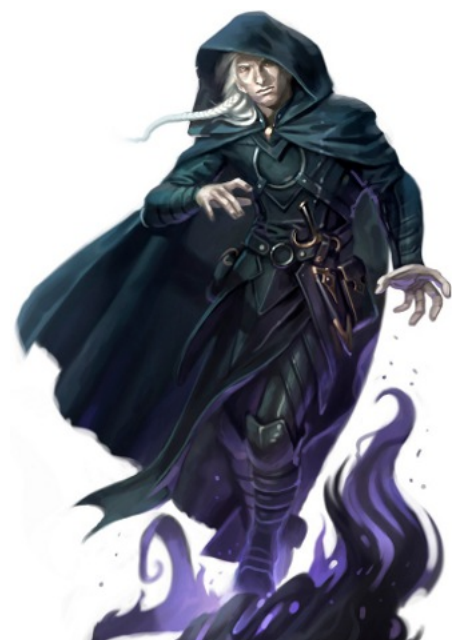
A necromancer heads a murder cult? Now, that's job security.

Exorcism. Each character may attempt a Wisdom or Divine 6 check to banish all Haunts displayed in front of that character; on a failure, that character buries his hand. Banish the Sihedron Medallion, then advance the blessings deck again.