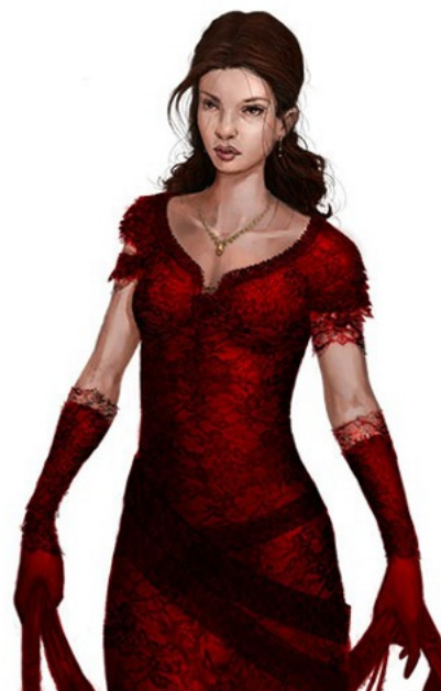
Kaven must have found her...enchanted.

Unanticipated Obstacles. Shuffle a barrier into each open location. Banish the Sihedron Medallion, then advance the blessings deck again.