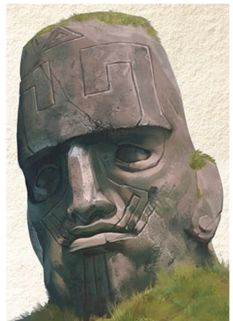
They've been glowering for ages.

Altitude Sickness. Each character must succeed at a Constitution or Fortitude 10 check or take 1d4 combat damage. Advance the blessings deck again, then shuffle the Sihedron Medallion back into the blessings deck.